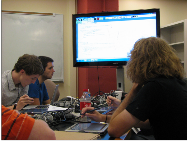
(a) A studio section using Tablet PCs